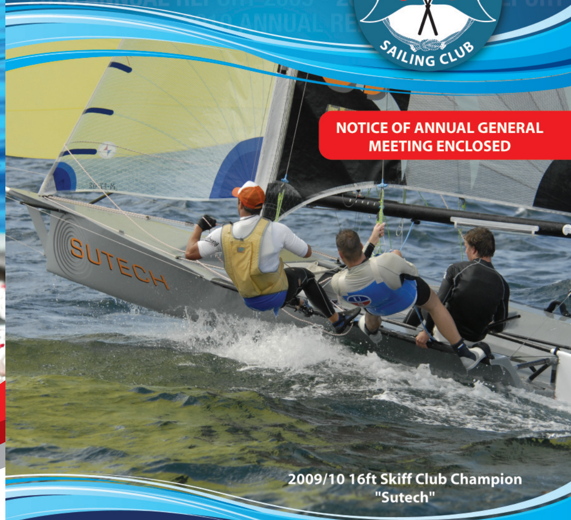
2009/10 16ft Skiff Club Champion "Sutech"

NOTICE OF ANNUAL GENERAL MEETING ENCLOSED